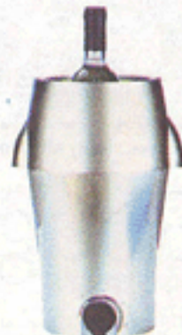
Battery-operated Vin Chilla £89.95