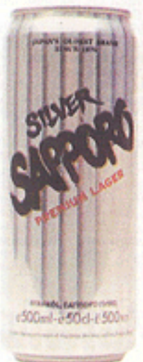
Sapporo beer £1.70 and, below left, Goldfish crackers £1.95