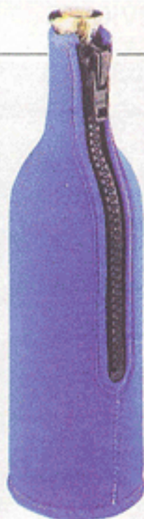
Zip-up wine cooler £19.95