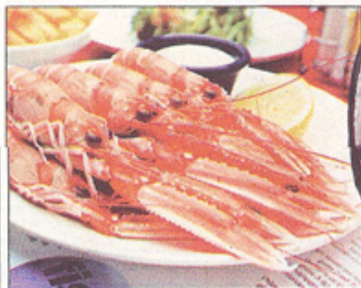
3kg of fresh langoustine, £21

Tom Conran, owner of Tom's delicatessen: Cheese-flavoured Goldfish-shaped crackers are very handy for keeping children happy and cans of Sapporo beer are my favourite for cooling down. Where to buy: Goldfish crackers £1.95; Sapporo beer £1.70, both from Tom's, 226 Westbourne Grove, W11 (020 7221 8818).