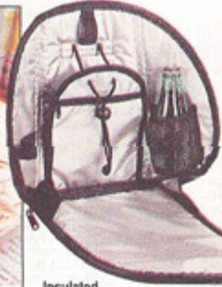
Insulated picnic backpack £19.95